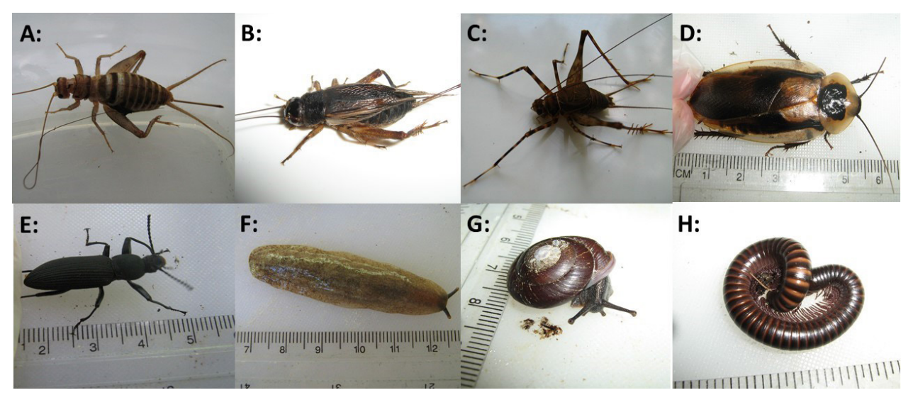
Fig. 2. Cultured species at the CBP in Dominica. (A) Gryllodes sigillatus. (B) Gryllus assimilis. (C) Caribacusta dominica. (D) Blaberus discoidalis. (E) Zophobas atratus. (F) Veronicella sloanii. (G) Pleurodonte dentiens. (H) Leptogoniulus sp.

These were removed from housing units after two weeks, or sooner if hatchlings were observed (Fig. 3B). After removal, oviposition sites were placed into separate housing units until all 1<sup>st</sup> instar crickets hatched and exited the nest box. The substrate in the oviposition sites was kept moist at all times.